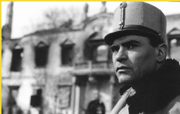
Liviu Ciulei starring in his 1964 film Forest of the Hanged

An internationally renowned actor and stage director (including five years as artistic director of the Guthrie Theater in Minneapolis), the late Liviu Ciulei (1923-2011) was also the director of three intensely cinematic feature films from Romania's first "new wave" of internationally acclaimed filmmakers. We are pleased to present the first complete U.S. retrospective of Ciulei's rarely screened films, in the presence of actress Irina Petrescu, star of Danube Waves .